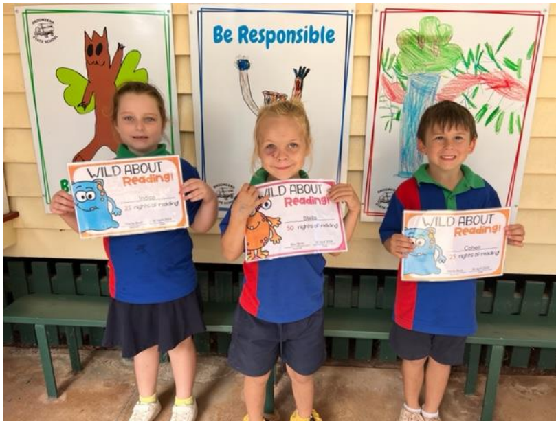
Indica and Cooper Reading for 25 nights Stella Reading for 50 nights